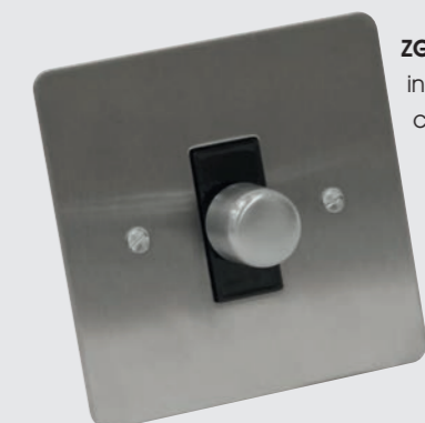
ZGRIDLED+ in black with polished chrome plate and knob